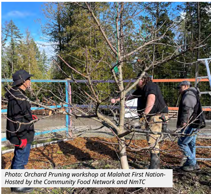
Photo: Orchard Pruning workshop at Malahat First Nation- Hosted by the Community Food Network and NmTC

As always, please feel free to reach out anytime for any food security or food sovereignty related projects, programs, or requests. Call/text 604-726-5139 or email meganc@nautsawmawt.com