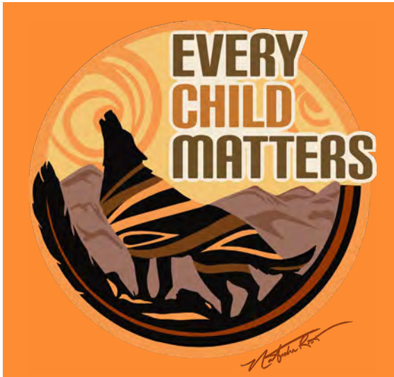
Msit No'kmaq "All My Relations."

"With this design, I have created a symbol of a warrior and the ability to stand proud for who you are, wherever you are. Descending from relatives who faced the challenges of residential schools, I draw strength from their endurance. Conversations with elders, sharing reflections of a painful past, highlight the urgency of addressing intergenerational trauma.