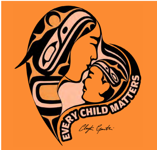
Mother - Caretake and Child

“With this design, I have created a symbol of a warrior and the ability to stand proud for who you are, wherever you are. Descending from relatives who faced the challenges of residential schools, I draw strength from their endurance. Conversations with elders, sharing reflections of a painful past, highlight the urgency of addressing intergenerational trauma.