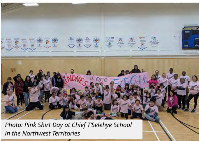
Photo: Pink Shirt Day at Chief T'Selehye School in the Northwest Territories