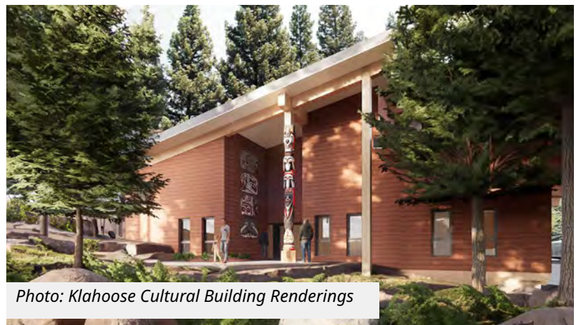
Photo: Klahoose Cultural Building Renderings